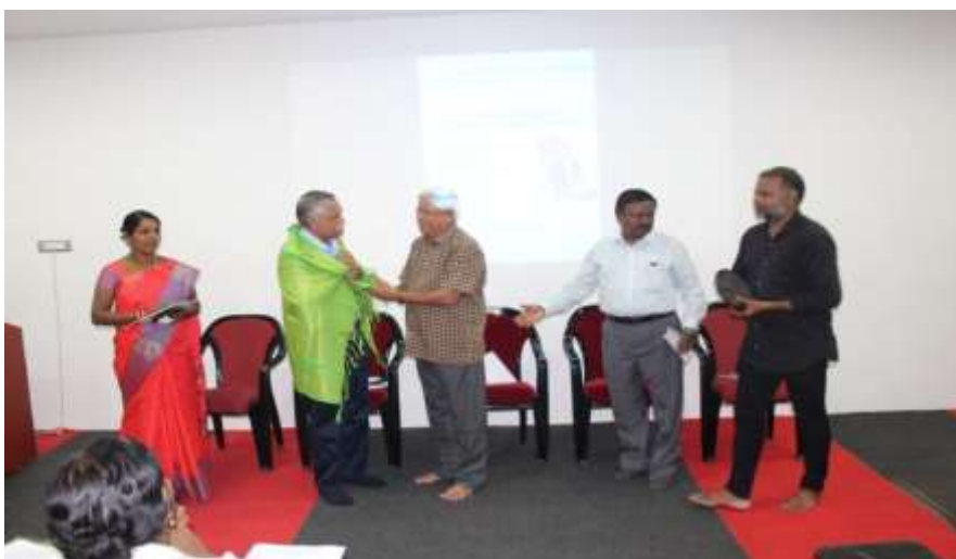
Chief Guest been honored by Fr. Chairman and Fr.Secretary