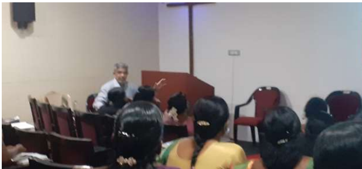
Resource person demonstrating with examples the art of PowerPoint presentation