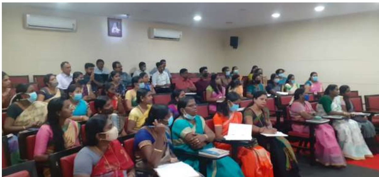
Faculty Members participating in the FDP with utmost interest