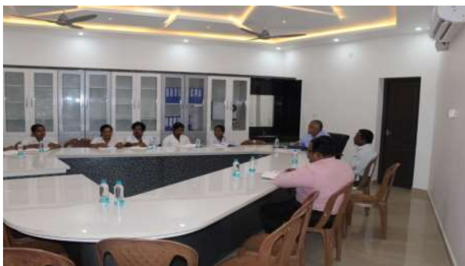
IQAC Team Discussion with the Resource Person

The faculty members were aware of the quality initiatives to be taken in the teaching learning process.