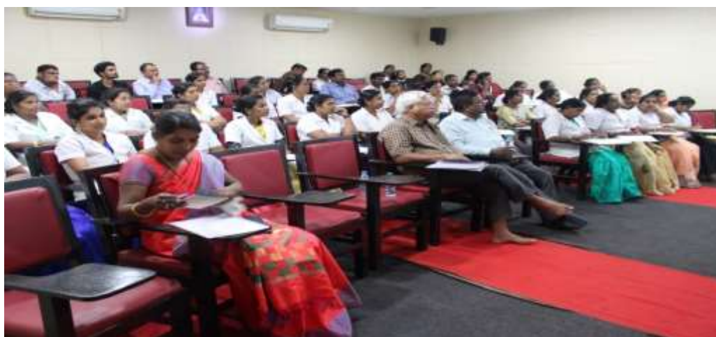
Faculty members attending the meeting