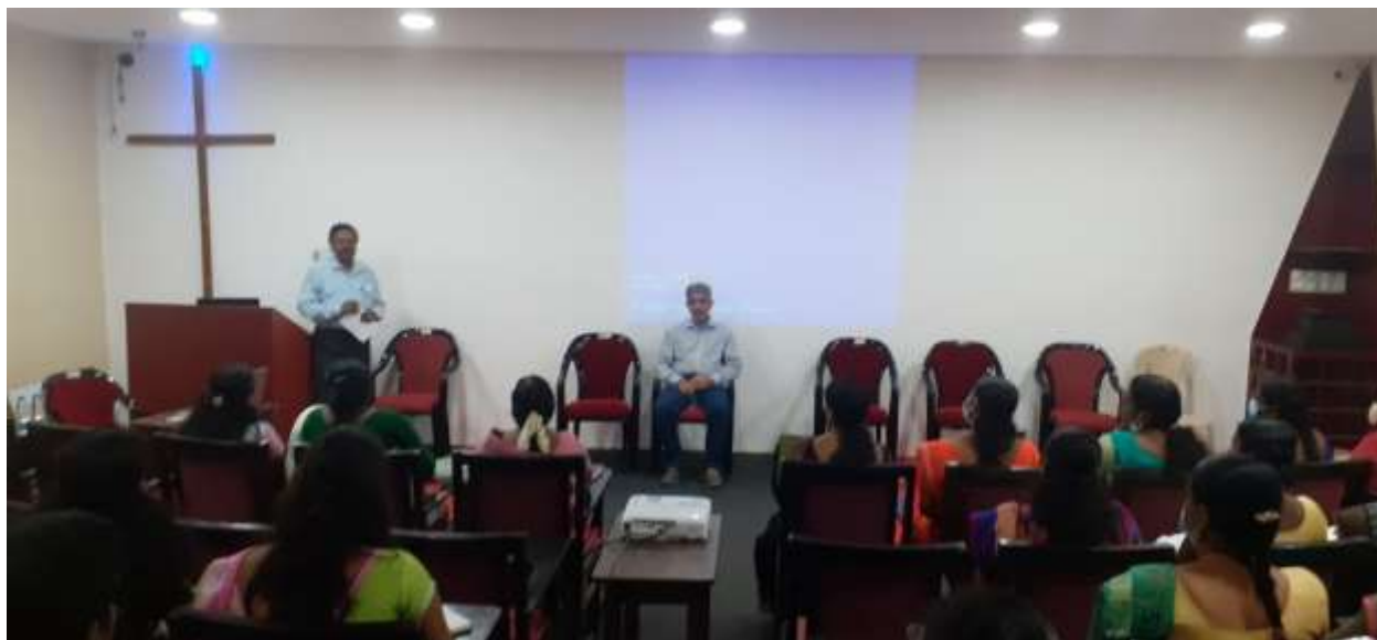
Principal Welcoming and Introducing the Resource Person to the Gathering